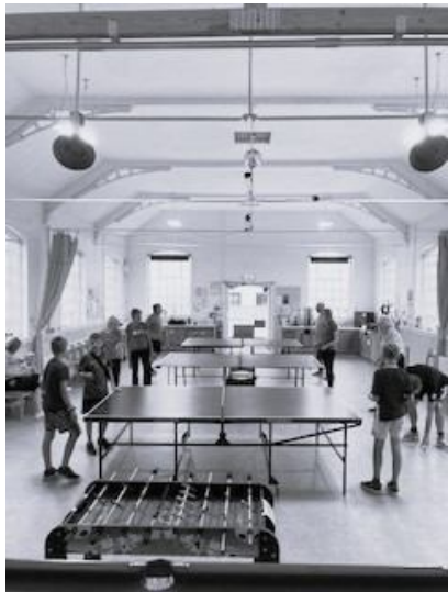
Table-Tennis Club now meets

Mondays at 7.30pm and Tuesdays at 1.45pm.